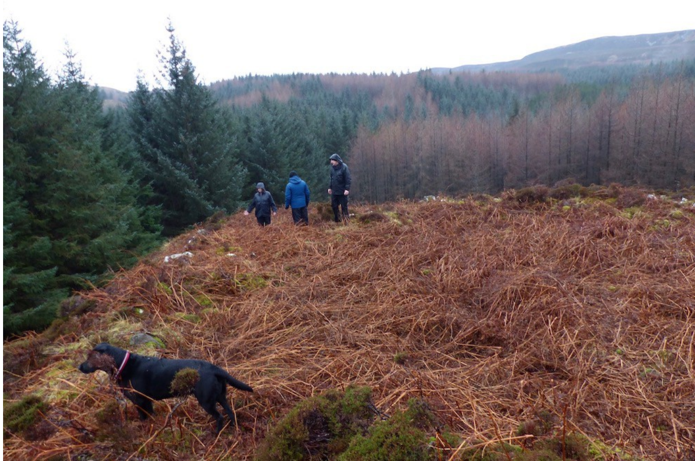
Above: east wall and central depression. Below: rectangular enclosure in foreground and cairn.