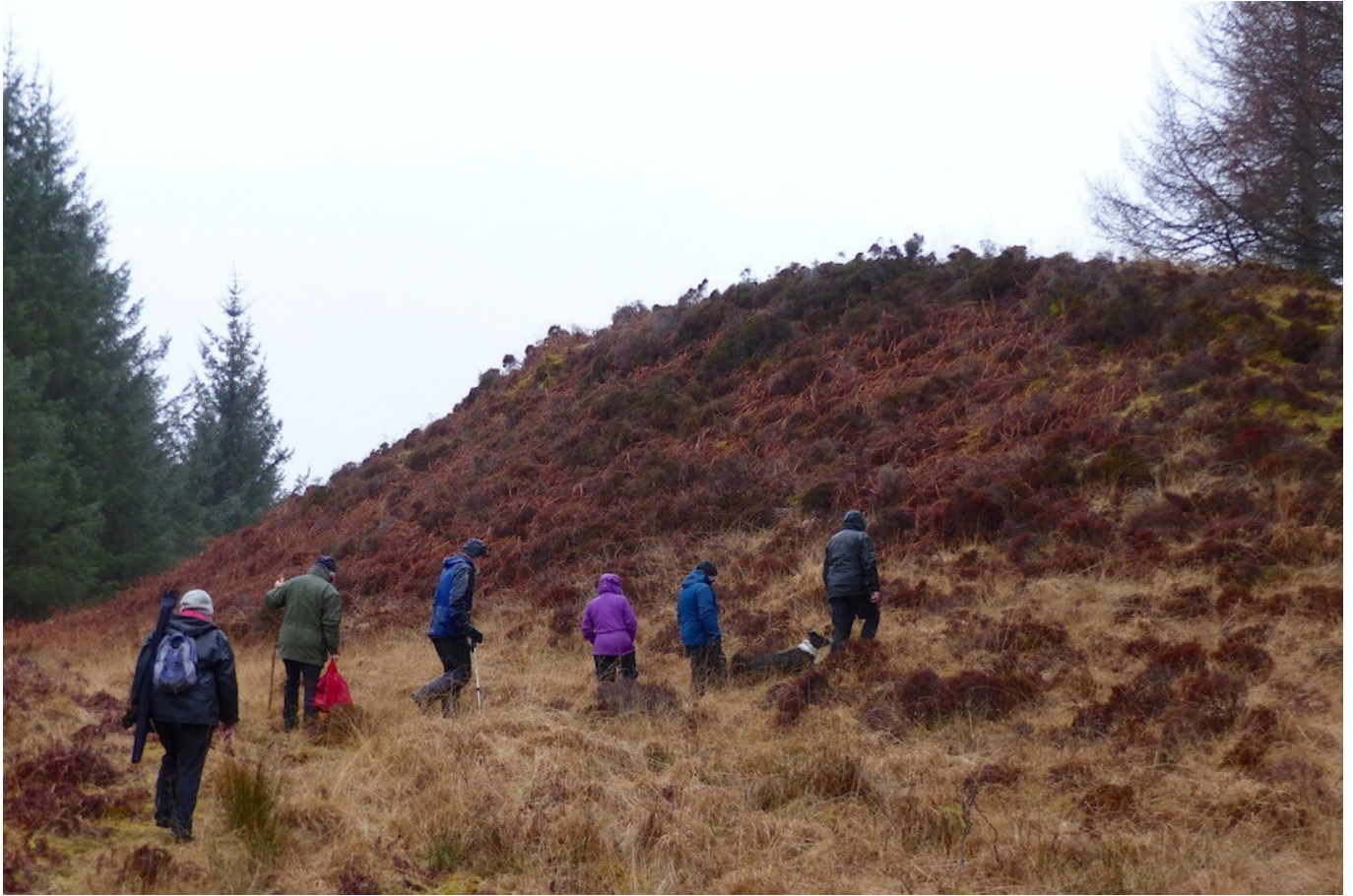
Above: approaching the dun from the north. Below: the east wall