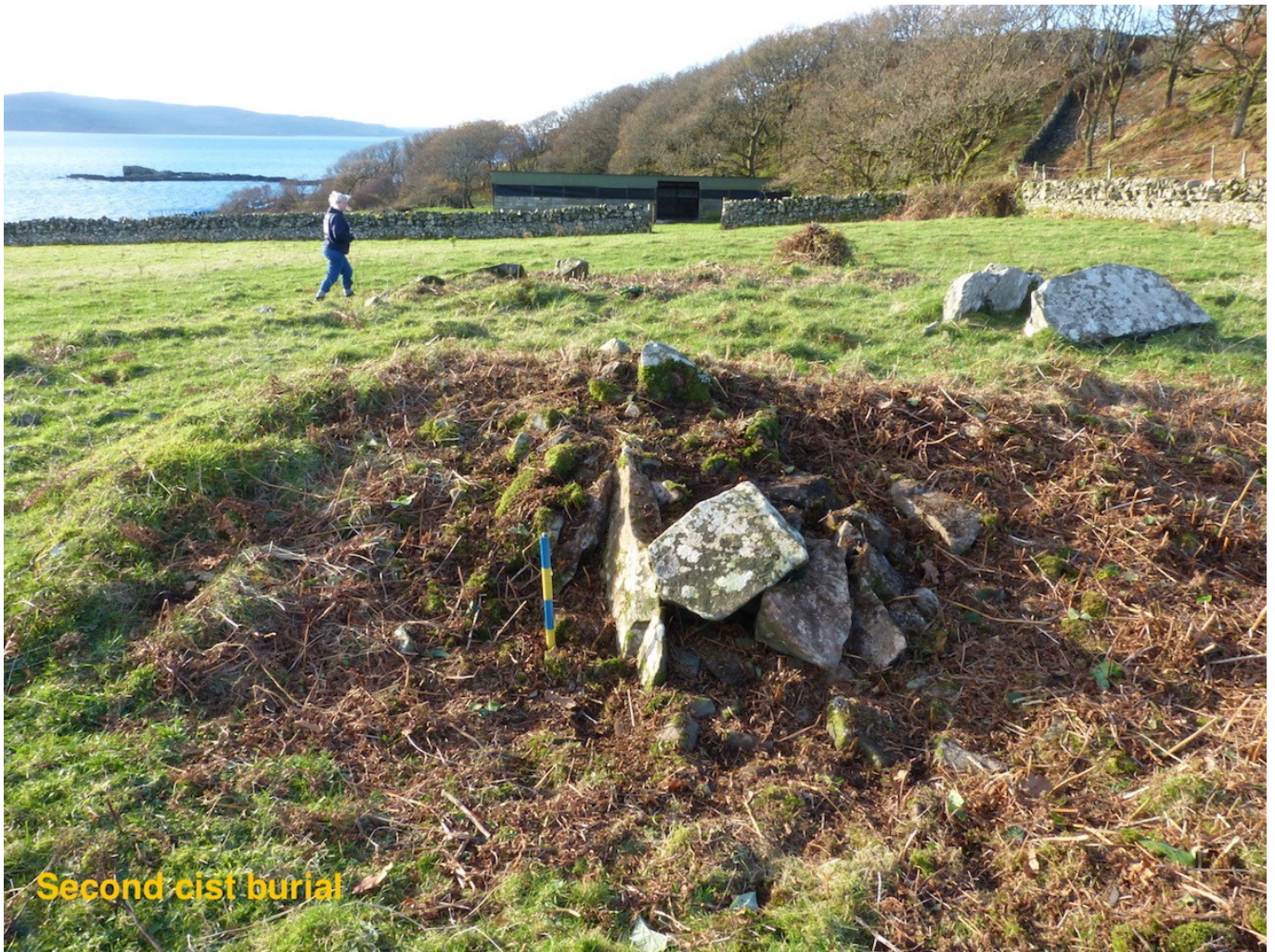
Second cist burial