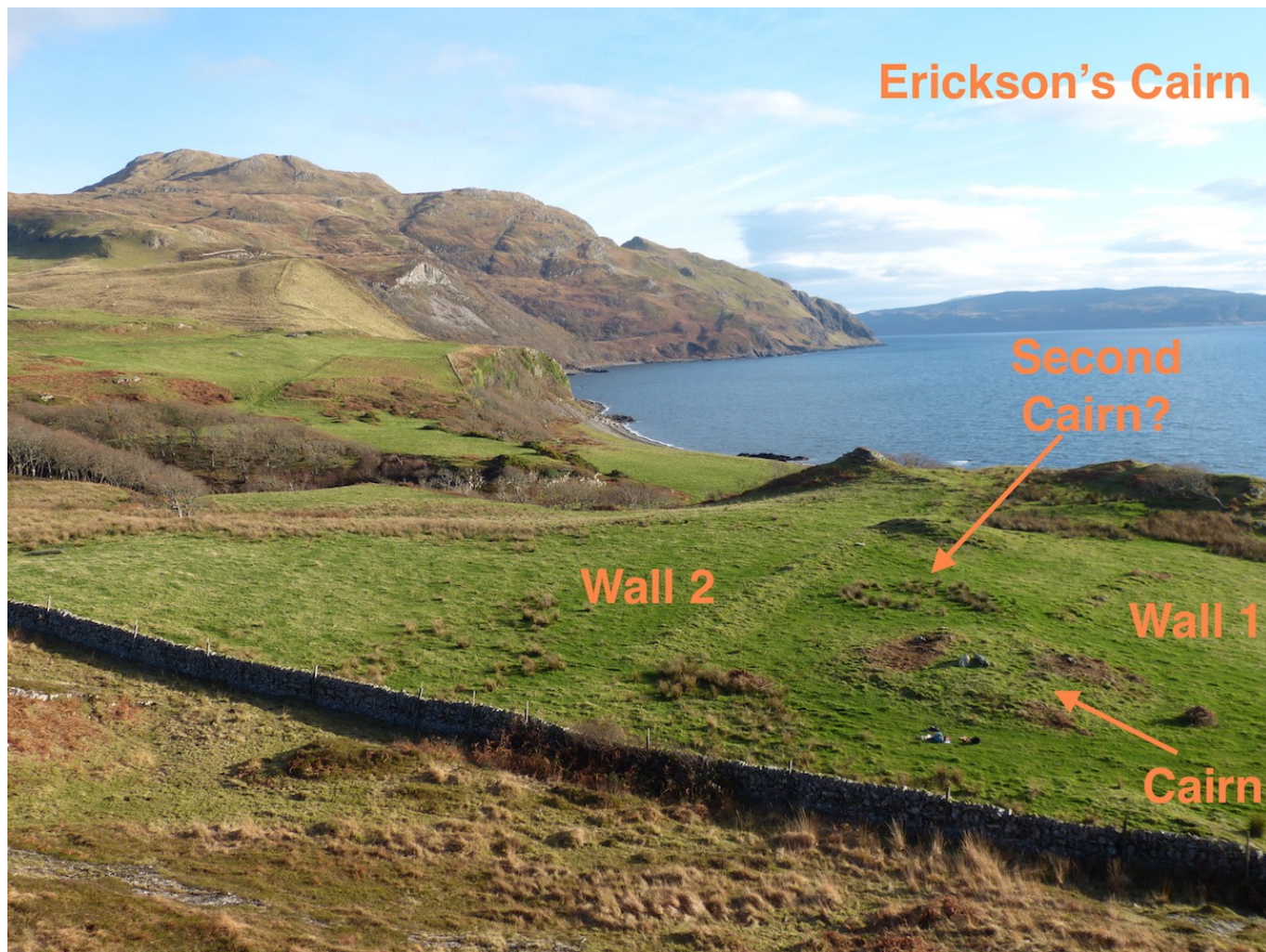
509633 Erickson's Cairn