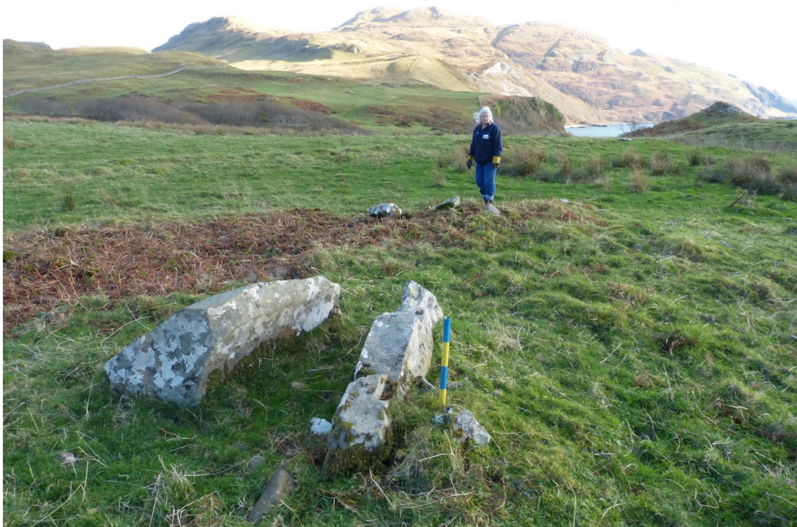
Looking approx East