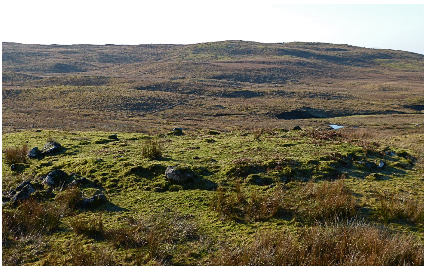
View of circle from the northeast.